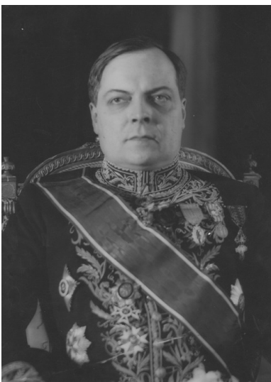
A critical review of the Polish policy during the Czechoslovakian