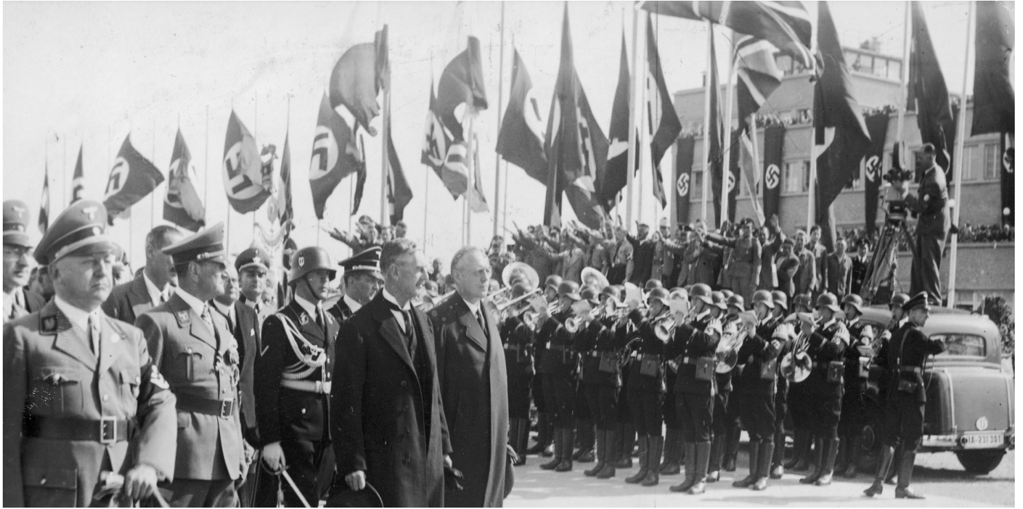
The arrival of the Prime Minister of Great Britain Neville Chamberlain to the four powers' conference in Munich, September 29-30 1938