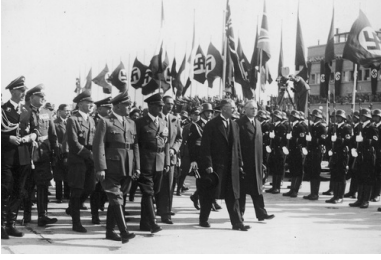
The arrival of the Prime Minister of Great Britain Neville Chamberlain to the four powers' conference in Munich, September 29-30 1938