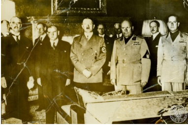
Photocopy of the photography of the signing of the Munich Agreement 29-30 IX 1938 In the first row from the left are Neville Chamberlain, Edouard Daladier, Adolph Hitler, Benito Mussolini, Galeazzo Ciano.

of the territory of the first Czechoslovakian Republic was made on September 29 th during a conference in Munich, with the silent approval of France, Great Britain and Italy. The democratic states remained passive in the face of Hitler's demands. The final shape of the new borders was to be established by the commission consisting of representatives of the states present at the Munich conference and the Czechoslovakian Republic. The participants of the conference also published an additional statement to the treaty which considered the Polish and Hungarian minorities in Czechoslovakia. When compromise was unreachable on these matters after three months, another meeting of the Munich four was announced.