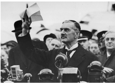
British Prime Minister Neville Chamberlain delivers a speech to the crowds gathered at Heston airport regarding the agreement signed in Munich, September 30th 1938

It was also clear that the demonstrative offer made by the Soviets to send troops to aid Czechoslovakia, based on the treaty of mutual help made between Prague and Moscow in 1935, had no chance of being realised. Such actions were only possible if France engaged its army in the defence of the Czechoslovakian Republic, which was never even considered by its leaders, as proven above. Therefore, the fact Poland did not allow the Red Army to pass through it was not the reason behind the lack of aid from the Soviet Union. The offer made by the USSR was nothing but propaganda aiming to strengthen the picture of the communist empire as the determined “defender of peace”, while the threat of breaking the non-aggression pact with Poland from 1932 was part of the show of force policy.