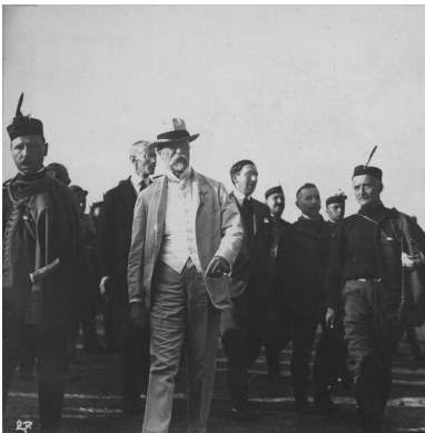
President of Czechoslovakia Tomáš Masaryk at the Falconry rally in 1920

The authorities of the First Czechoslovakian Republic were prepared for the possibility of Poland’s fall, which finds confirmation in the so-called plan “B” (Bolsheviks). The military would guard the borders with Poland and be ready for taking in refugees to later be sent across the Czechoslovakian territory. The Czech government tolerated manifestations of support for the Bolsheviks which took place especially on August 19, 1920.