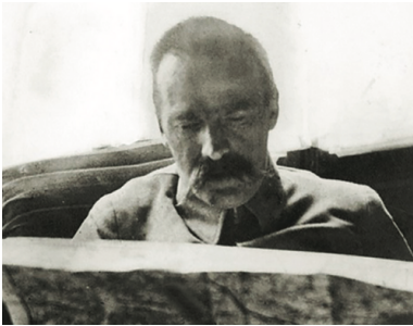
Józef Piłsudski over a staff map during the Battle of Warsaw (Public Domain)

A serious problem on both sides was the exchange of prisoners of war. The exact number of Polish POWs is not known - historians assume that there could have been between 44 to 60 thousand of them. The conditions in the Soviet camps were comparable to those in which Red Army soldiers were held on the territory of the Second Polish Republic. It is difficult to determine the number of deaths from diseases. By October 1921, nearly 26.5 thousand people returned to the country. Over 20,000 never crossed the border and with a high degree of probability it can be concluded that most of them did not survive captivity, were shot or died of exhaustion and starvation.