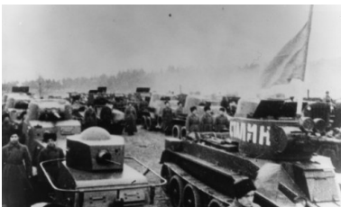
Red Army troops awaiting the

The entering of the Soviet troops to Poland was a shock for the government at the time. Gen. Edward Rydz-Śmigły, serving as the Supreme Commander, gave the general order not to engage at all with the Red Army, with the exception of being fired upon or if the Soviets attempted to disarm the Polish troops, and to retreat towards Romania and Hungary. Despite the enemy's advantage and the surprise factor, Polish soldiers and citizens showed brave resistance. In many towns, small battles with the Soviets took place, i.e. at Kowlo, Sarny, Baranowicze, Tarnopol. The rank of national symbols gained the defence of Vilnius (September 18-19), Grodno (September 20-21) and even Kodziowce (on the night from September 21 st to September 22 nd ) fought between the regiment of uhlans and the Soviet armoured division, or a two-day battle near Szack (September 28-29) fought between the Border Protection Corps under the command of gen. Wilhelm Orlik-Rückemann.