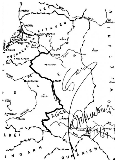
Map of the final division of Poland between the Third Reich and the Soviet Union from 28 IX 1939 with the marked border and original signatures of Joseph Stalin and Joachim von Ribbentrop

Lasting almost two years, the occupation of these territories by the USSR equalled ruthless terror for the Polish citizens. Among the means of repression used by the Soviets were arrests, deportations to gulags, the Katyń Massacre. The total toll of the Soviet occupation is not yet entirely known today. Historians estimate that only in September 1939 soldiers of the Red Army and members of the operational secret services Cheka murdered 2.5 thousand prisoners and several hundred civilians, while during the two years of occupation at least 800 thousand Polish citizens were sent deep into the USSR (this number includes both POWs, people sent to gulags, deportees, those mobilised to the Red Army, people who decided to work at the USSR or were evacuated with the front when war broke out between the two aggressors in June 1941).