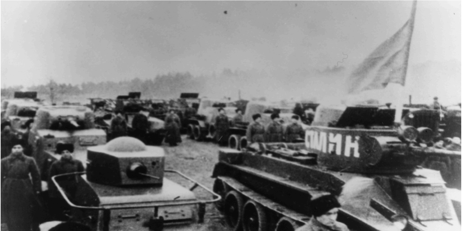
Red Army troops awaiting the beginning of a parade in Białystok, September 1939