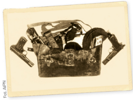
↳ Torba z uzbrojeniem znaleziona przy zabitym „Laluś”