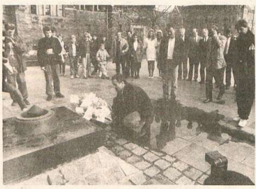
Przy pomniku „Poznańskiego Czerwca”.