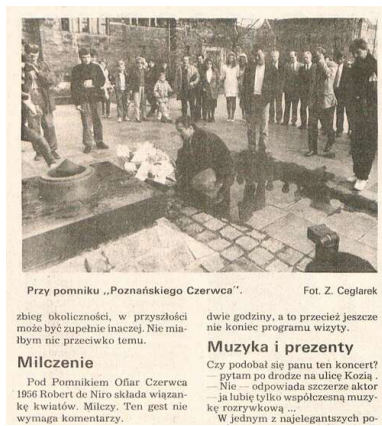
Przy pomniku „Poznańskiego Czerwca”.