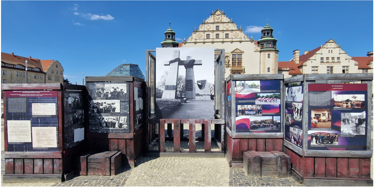
The 1956 Poznań protests