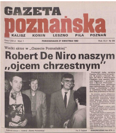
Poznań Newspaper, issue no. 99, 27.04.1992, archives of the Poznań University Library. The headline says: Robert De Niro: our spiritual “god father”

Robert De Niro’s first visit to Poland came in 1989, when our country was taking its first steps on the road to freedom. During this eventful visit, on September 21, 1989, Robert De Niro met with Lech Wałęsa in Gdańsk. During this almost two-hour long meeting, attended by, among others, Wojciech Fibak and Gustaw Holoubek (famous Polish actor), they talked about the future of Poland. Then, on the very same day, Robert De Niro went to the Monument for the Fallen Shipyard Workers and the shipyard’s gate, to see with his own eyes the place of the 1980 August Strikes, which brought us the “Solidarity” movement. On September 23, Robert De Niro also visited Oświęcim, where he laid flowers in tribute to the victims of the former Nazi German concentration camp.