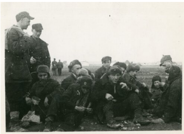
An inscription on the back of the photo says: Stalin's paradise...

In the end, the matter was resolved negatively in the amended draft of the Polish-Soviet act, presented by Mayski on July 17, 1941. There was no additional point on the release of political prisoners. In response, on July 21, 1941, Sikorski once again added this point to the pact. It was of fundamental importance for him and was the conditio sine qua non for making an alliance with the Soviet side.